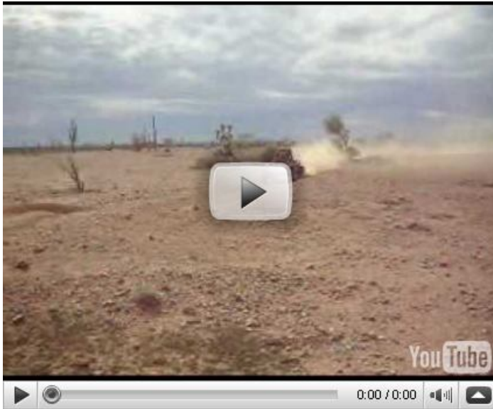
YouTube - turbo's flip.wmv